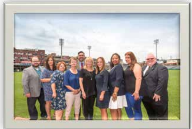
Charleston CVB Staff