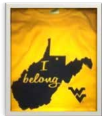
West Virginia University PRSSA Chapter