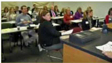
South Charleston attendees

The folks shown below are just some of the more than 80 public relations professionals and nonprofit organization representatives who participated in the October 19 “PR Boot Camp for PR Professionals and Nonprofits” at locations in Buckhannon, Huntington, Morgantown, Parkersburg and South Charleston.